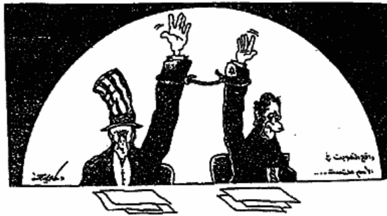
Voting in the U.N.