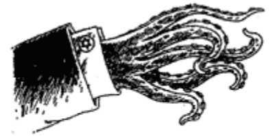
Syrian Daily Al Baath, October 21, 1998

There are frequent anti-Semitic articles and caricatures in the Syrian media, including classical anti-Semitic stereotypes, comparisons of Israel with the Nazis and Holocaust denial. After Roger Garaudy, the French Holocaust skeptic, was invited to Damascus by the Ministry of Information, the government-owned newspaper Tishrin praised Mr. Garaudy for "exposing the lies of the Zionist movement which exaggerated what happened to Jews during the Second World War for political purposes." A recent theme is the "international Jewish conspiracy" behind the Lewinsky affair.