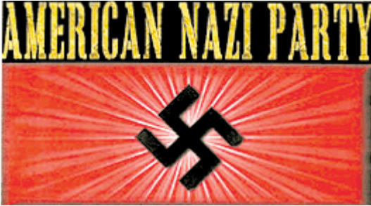
American Nazi Party (ANP)

Red flag with swastika in center headed by the banner 'American Nazi Party'. Basically, it is a variation of Adolf Hitler's Third Reich flag.