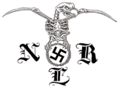
NLR or Nazi Low Riders

The Aryan fist is a symbol of white power used by hate groups who promote their racist agenda as white pride activism. Note: the laurel wreath appearing in the above graphic illustrating the 'Aryan fist' is actually not a racist symbol itself, but rather a separate common skinhead symbol stemming from the logo of a line of British clothing that became popular among skinheads. It is the white fist itself that is the symbol of intolerance.