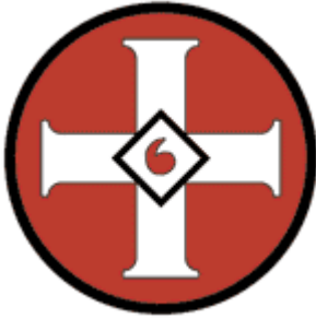
Ku Klux Klan (KKK)

A cross in a circle with the 'blood drop' in the center.