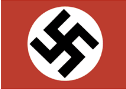
Nazi Germany Flag

the Aryan Brotherhood. It exploded in membership in the 1990s. The state prison system currently recognizes the NLR as a criminal gang, which affects their treatment within correction facilities. Members of the gang are involved in the drug trade and white supremacist ideology is a strong part of the gang's character.