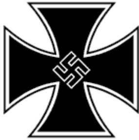
Nazi Swastika with Iron Cross

wearer has murdered one of the movement's enemies (a Jew or other ethnic minority member).