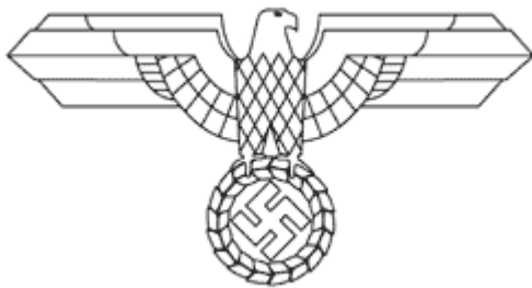
Eagle atop Swastika

It is now a symbol used by neo-Nazis, racist skinheads and white supremacists. The swastika was adopted by Germany's Nazi Party. Adolf Hitler made the Nazi swastika unique to his party by reversing the normal direction of the symbol so that it appeared to spin clockwise. Today, it is widely used, in various incarnations, by neo-Nazis, racist skinheads and other white supremacist groups.