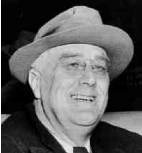
ROOSEVELT DETERMINES ON WAR AS EARLY AS 1939