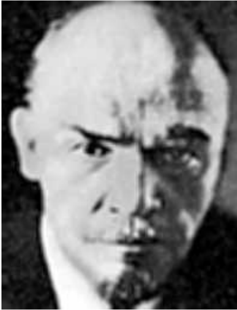
Ilich Ulin (Vladimir Ilich Uliyanov or Nikolai Lenin). President of the Supreme Soviet, Jew on mother's side. His mother was called Blank, a Jewess of German origin.

"By May, 1st, 1937, there should not be one single church left within the borders of Soviet Russia, and the idea of God will have been banished from the Soviet Union as a remnant of the Middle Ages, which has been used for the purpose of oppressing the working classes." (Joseph Stalin)